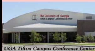
UGA Tifton Campus Conference Center