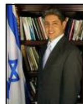
Ambassador Reda Mansour

The exhibition is the first significant art exhibition to be hosted at the Conference Center and represents the strong connection that has been established between the Israeli Consulate and UGA. Not only is it a significant art exhibition, but also it is a way to create greater cultural understanding between nations. It is Israel's desire to garner a positive exposure, showing specifically what it has to offer beyond conflict.