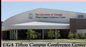
UGA Tifton Campus Conference Center

15 RDC Road Tifton, GA 31794 229-386-3416