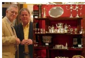
Vendor at Antique Show