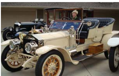
1909 Rolls Royce