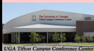
UGA Tifton Campus Conference Center