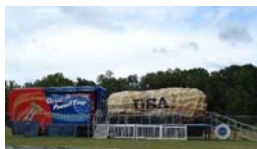
National Peanut Museum