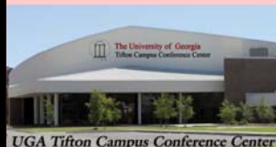
UGA Tifton Campus Conference Center

15 RDC Road Tifton, GA 31794 229-386-3416